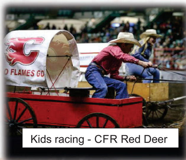
Kids racing - CFR Red Deer