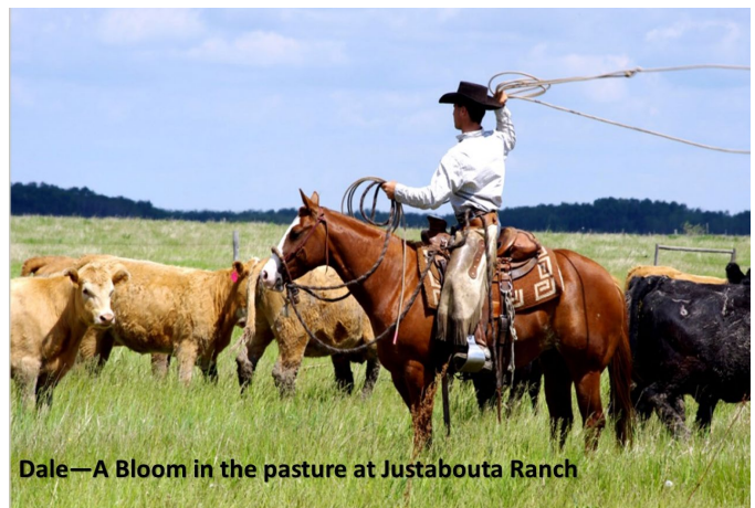
Dale—A Bloom in the pasture at Justabouta Ranch

In working with a lot of animals over the years I have never found an animal that thinks about the end the way us humans do. We are the only species that knows there will be an end. God has given us each a conscience. The word “Conscience” means With Knowledge. So therefore, we know (different than the animals) that there will be an end.