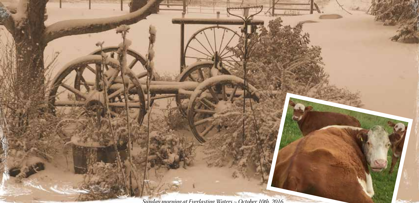
Sunday morning at Everlasting Waters ~ October 10th, 2016