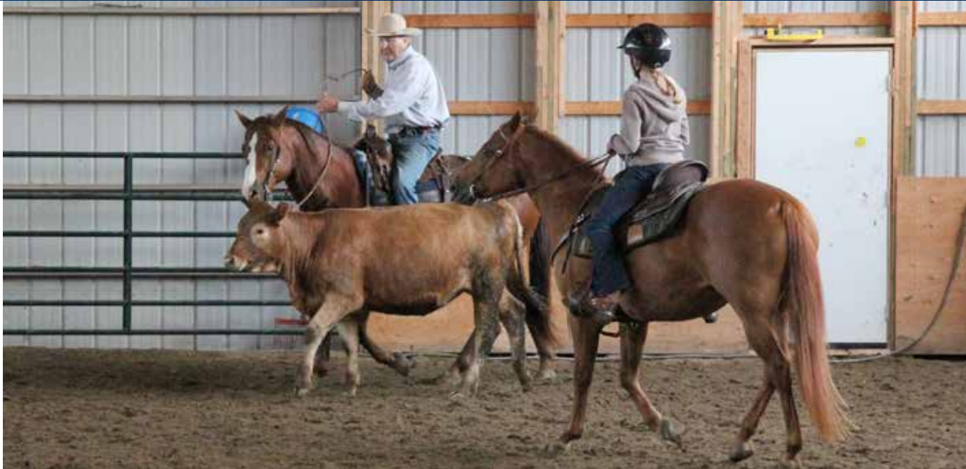
Great learning experiences at the Western Gatherin'.