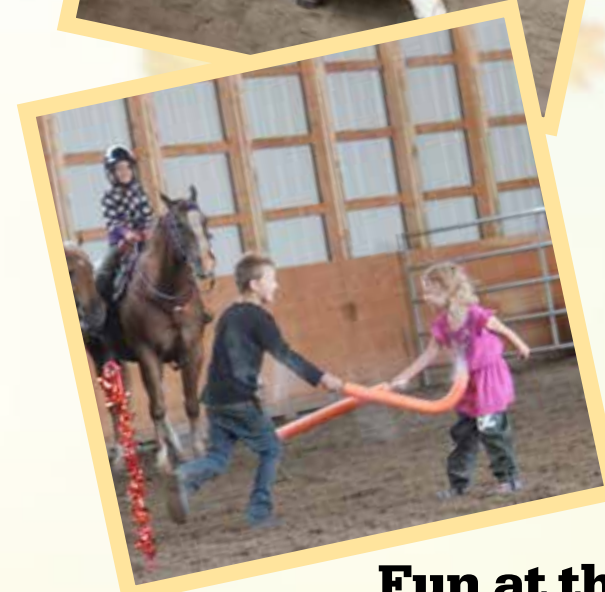
Fun at the Western Gatherin'