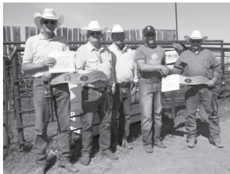
Thank you so much for your donation to our event. It is greatly appreciated. From Rafter Diamond R Saddle Series.