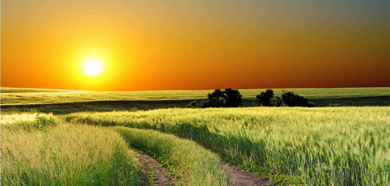
THE HARVEST SEASON IS FAST APPROACHING AS SUMMER GIVES WAY TO AUTUMN.